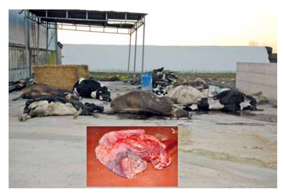
Figure 3 - Mortality and lesions in a BRDC outbreak occurred in a dairy herd during the summer season.

Table 1 - Body targets of microbial pathogens in calves during the first six months of life.(Diagnostic data from Unit of Infectious Disease of Animals, Department of Veterinary MedicineScience - University of Parma, ITALY.)