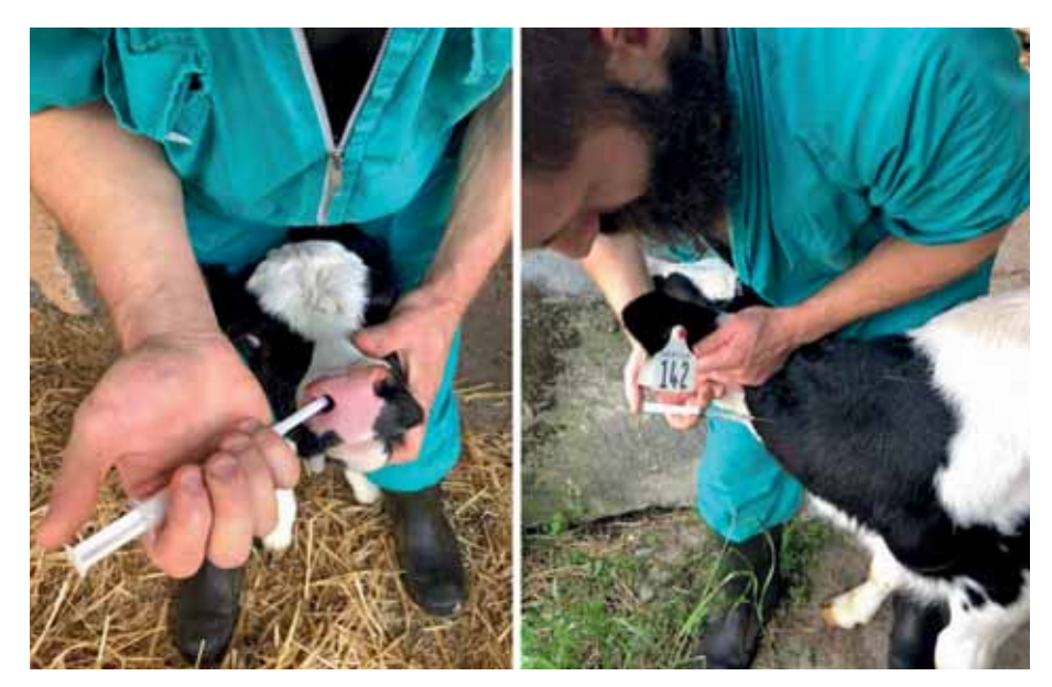
Figure 4 - Intranasal and parenteral vaccination of a dairy calf.

factors, predisposing onset of FPT status in calves, jeopardizes protective effect of colostrum. An accountable feedback: usually farmers do not accept persistence of enteric problems following pregnant cow immunization, therefore they could lose confidence in that vaccine and, at worst, in the vaccination practice, by and large.