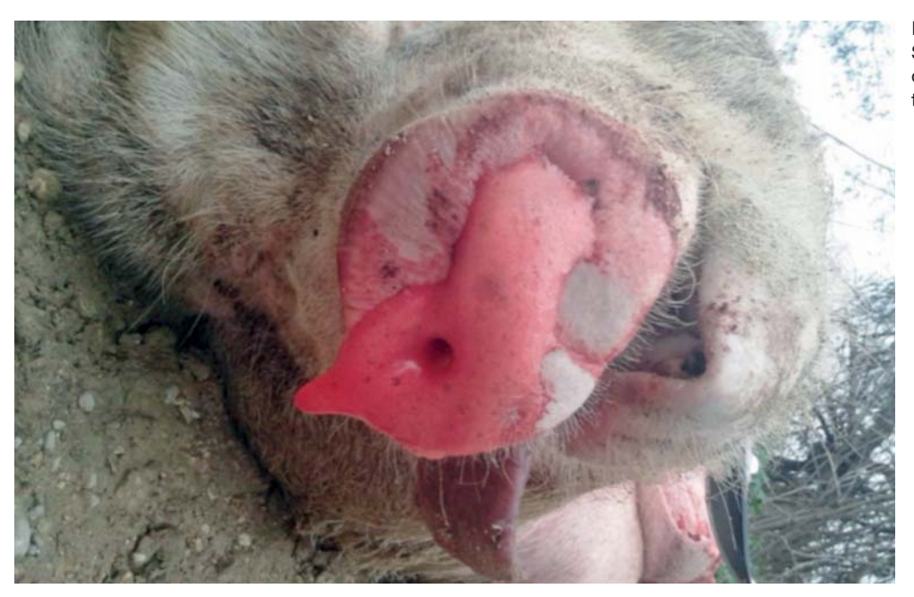
Figure 1 Sow. Abundant discharge of bloody-tinged foamy fluid from the nostrils.

the above breeding stock. Six sows were necropsied for diagnostic purposes. Pulmonary and lymph node samples were routinely processed for histopathological investigations. In depth bacteriological culture tests and biomolecular investigations for Mycoplasma spp.<sup>5</sup>, Influenza A virus <sup>6</sup>, Porcine Re productive and Respiratory Syndrome virus<sup>7</sup>, Porcine Cir covirus type 2<sup>8</sup> and Coronavirus spp.<sup>9</sup> were also carried out.